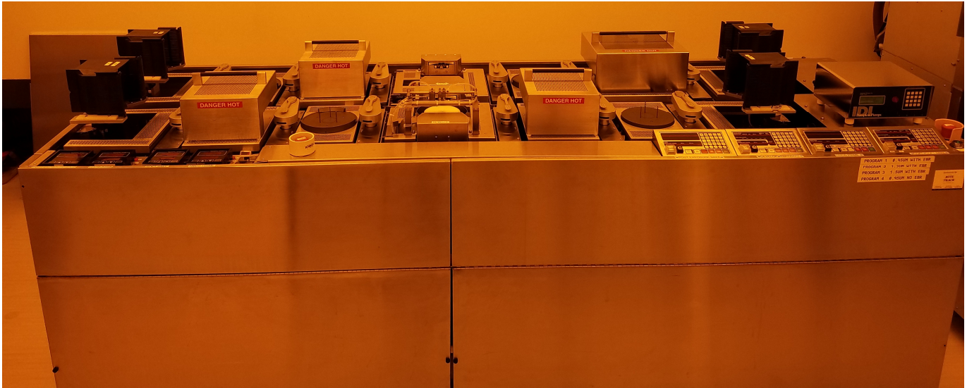
Fig. 1 SVG Track